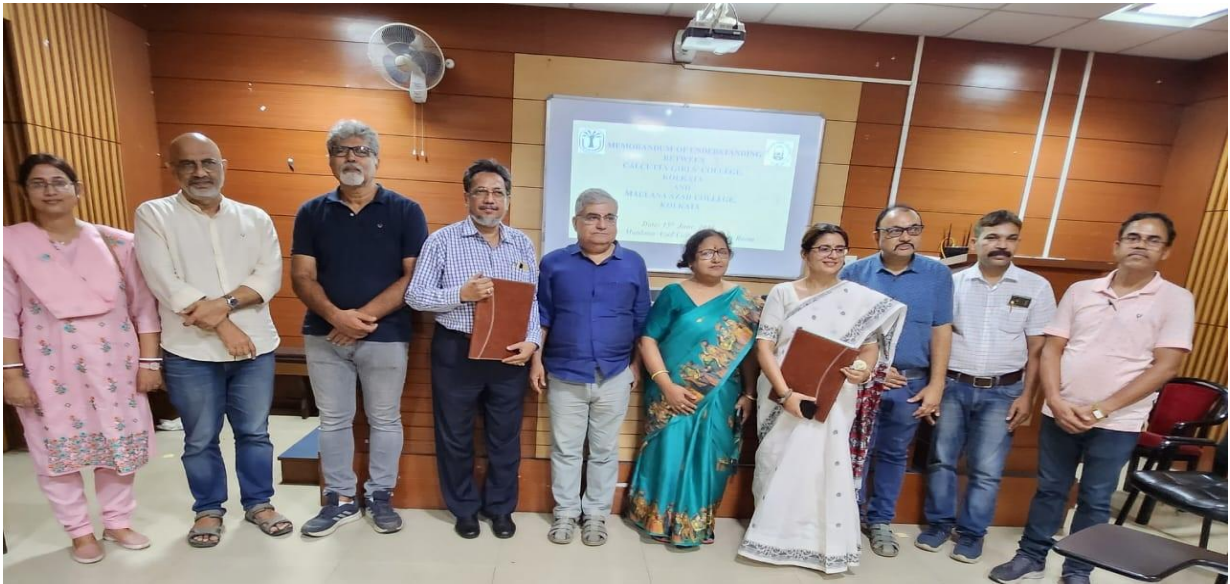
Mou Signing on 15.06.2023 between Maulana Azad College & Calcutta Girls' College